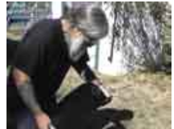
Walt from Poor Boy Choppers stops by with the black metallflake paint.