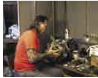
Polished Sputhe Shovel cases with 96" Ultima wheels & Jims shafts.

Photos and story by Scooter Brown - Wrenching by Rusty