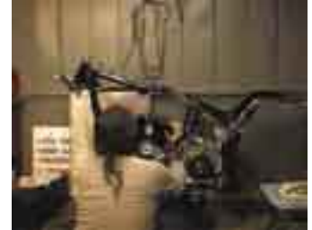
With lower triple tree in, it's time to hoist in the motor bad back and all.