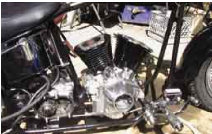
Drop the motor in the frame and add stock 80" cylinders, chrome cam cover, some rubber oil lines and a nice set of forward controls at this stage.