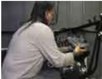
STD 2" plug "Shovelution" heads, Manley valves & roller rockers.