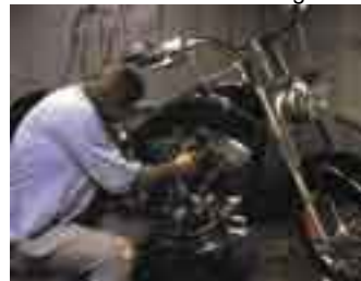
FatBoy light & tins, adjustable floorboards, SS cables and S&S G Carb.