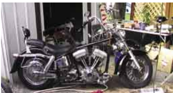
Had to have an Ultima Single fire ignition and coil, chrome saddlebag supports, BDL belt drive, chrome primaries and a custom headlight and Gordon is just about on the road.