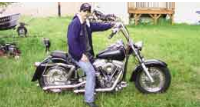
Got that S&S G carb, Spyke starter, old school drag pipes and some chopper wiring to finish her up. Top it off below with hand tailored Bags and a Grateful Dead derby cover.