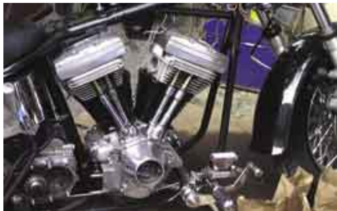
Rebuilt some early Evo heads with OEM valves, springs and rockers, but we did shave the heads for better compression. Andrews adjustable pushrods & stock covers.