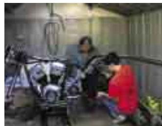
The 2 Rusty's hang a 1 1/2" drive belt and mount a stock HD swingarm.