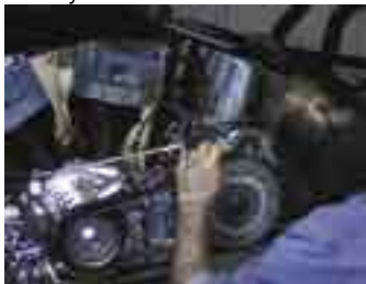
BDL 2" enclosed primary belt drive & billet shift rod & forward controls.