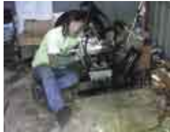
After installing lowering shocks he stabs in an Ultima 6 speed tranny.