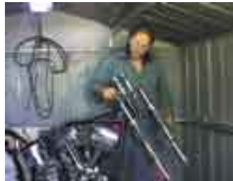
S&S springs/collars, Andrews push- rods & '07 FXSTC fork, lowered 4".