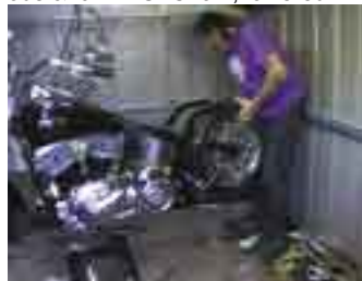
6" Glide top risers & 1 1/4" beach bars w/chrome controls & spoke wheels.