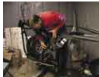
Along with boltless struts and trans pulley, comes wraparound oil tank.