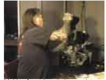
Mahl forged stroker pistons, RevTec cylinders & Crane cam.