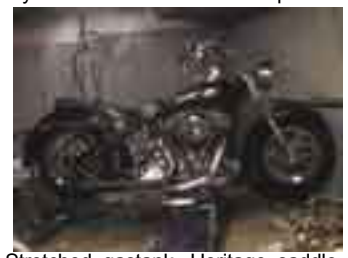
Stretched gastank, Heritage saddle, stock brakes & Sampson Pipes, all's that's left is oil, & brake lines & wiring.